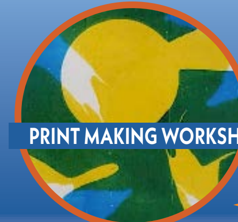
PRINT MAKING WORKSHOPS PAGE 2