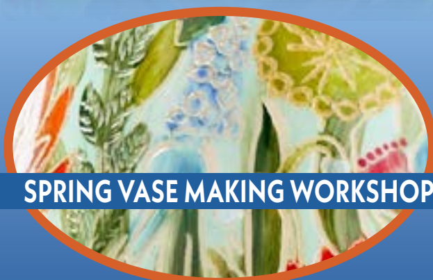
SPRING VASE MAKING WORKSHOP PAGE 2

* = workshops/classes with limited number of weeks Yellow= Teen classes